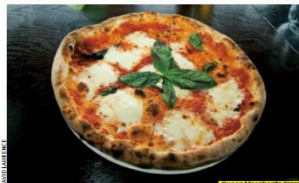
Queen Margherita Pizza