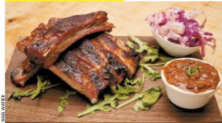
Art Kitchen and Bar